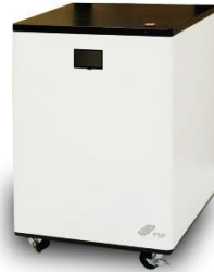
Energy Storage System